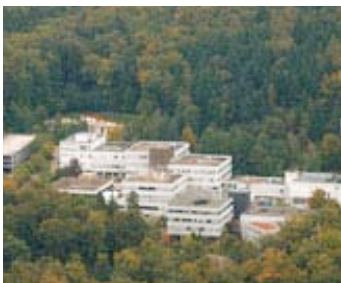
EMBL Heidelberg: The site of the 7 th European Molecular Biology Laboratory/EMBO joint conference