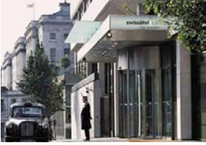
Swissôtel (Howard Hotel), London: Venue for TELOS conference April 7-8, 2007